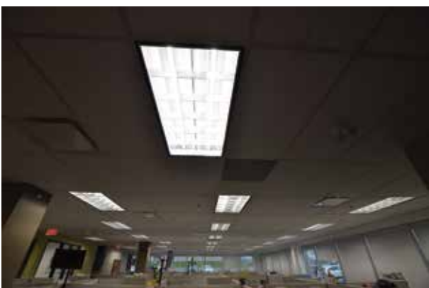
Red Tag - iTravel 2000 Head Office Mississauga, ON