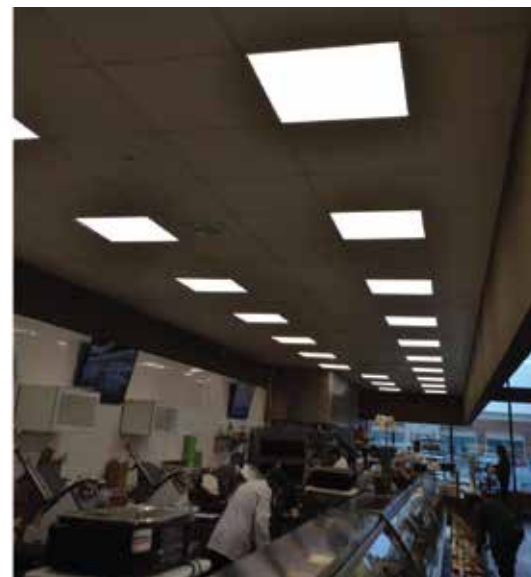
Nature's Emporium Burlington, ON